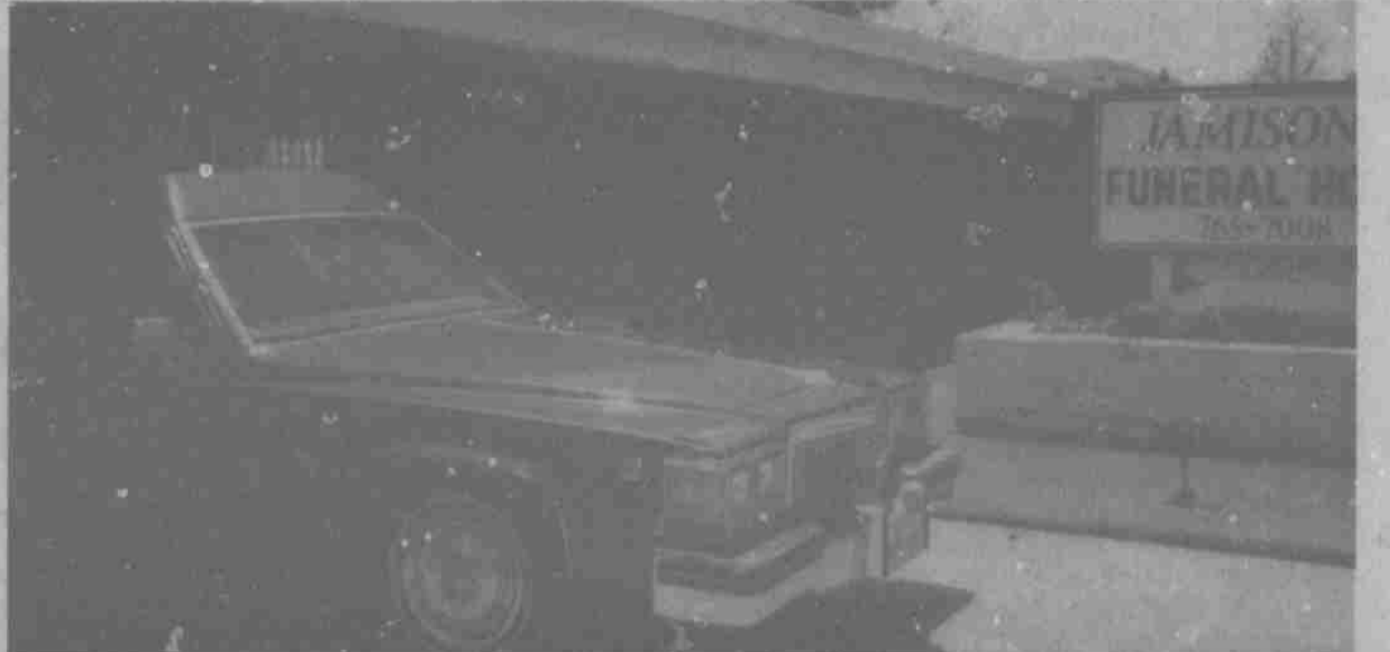
Picture 5 - The present facility in Lubbock, built in 1971