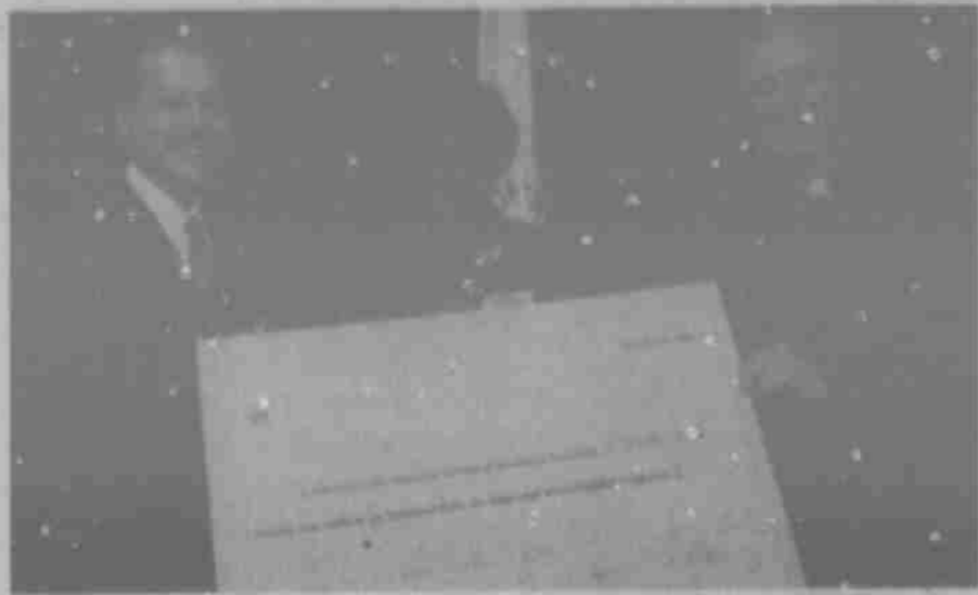
CNBC Receives HUD Grant Washington, DC— The Department of Housing and Urban Development (HUD) awarded the Congress of National Black Churches (CNBC) and 70 other non-profit organizations $21.6 million in funding.

The grant was awarded under HUD's Super Notice of Fund Availability (SuperNOFA) program designed to empower people to take initiative in improving their communities.