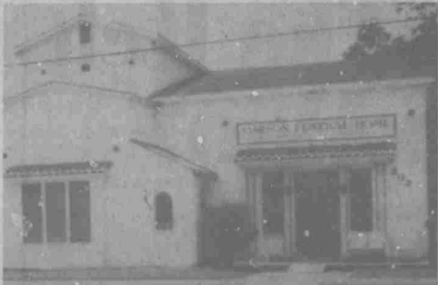
Picture 2 - The Present day Jamison Funeral Home in Yoakum, Texas