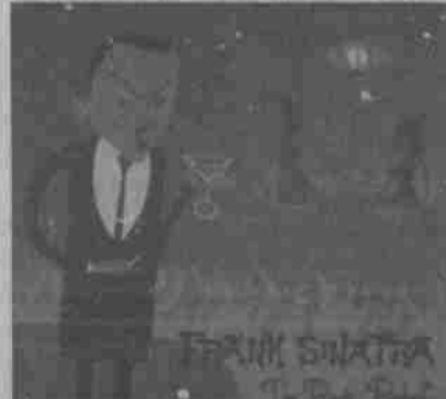
Frank Sinatra is characterized in this artist's depiction of an album that never was.

The Greatest Album Covers That Never Were has breathed new life to the lost art by giving nearly one hundred artists the opportunity to produce a fantasy album cover for a band or musician of their choice. Choosing