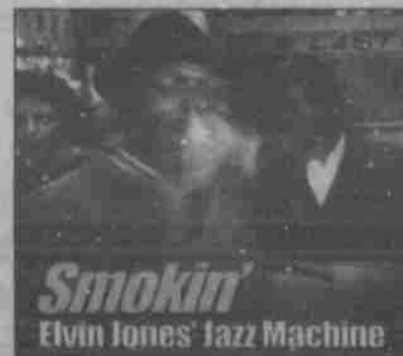
Pictured here is an artist's conception of an Elvin Jones jazz album.

The Buddy Holly Center will be presenting a traveling exhibition from the Rock and Roll Hall of Fame, The Greatest Album Covers That Never Were . The exhibit will be on display from April 19 through July 9, 2005 in the Buddy Holly