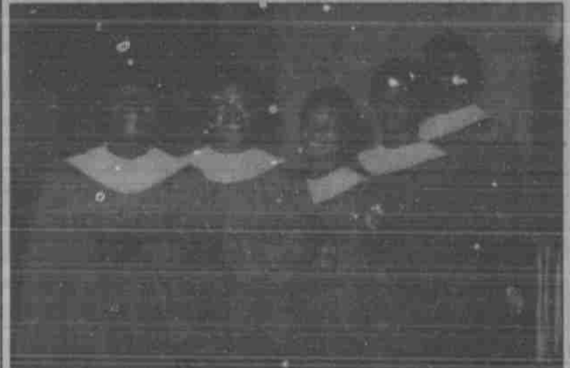
Glory Bound Train All A Board!