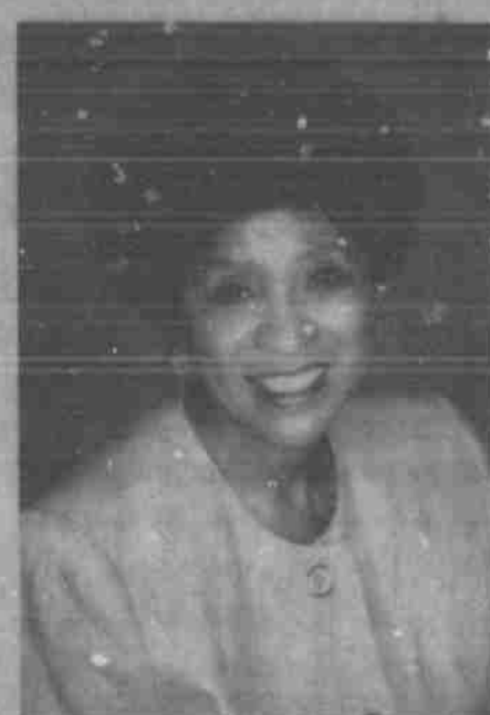
Gibbs Studio City, CA. - Eight-time NAACP Image Award winner Marla Gibbs has joined the cast of Passions