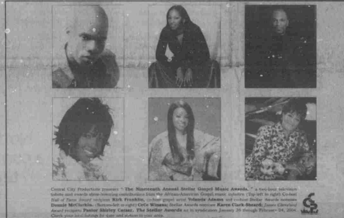
Central City Productions presents "The Nineteenth Annual Stellar Gospel Music Awards," a two-hour television tribute and awards show honoring contributions from the African-American Gospel music industry. (Top-left to right) Co-host Hal of Fame Award recipient Rick Franklin, co-host gospel artist Yolande Adams and co-host Stellar Awards nominee Donnie McClurkin. (Bottom-left to right) CoCe Winans; Stellar Awards nominee Karen Clark-Murray; James Cleveland Award recipient Pastor Shirley Caesar. The Stellar Awards air in syndication January 26 through February 24, 2004. Check your local listings for date and station in your area.

She sends a Happy New Year to all of our readers.