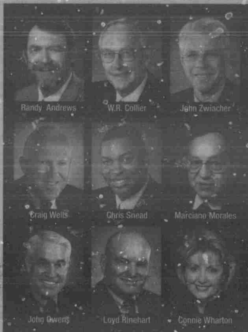
Members Of The Electric Utility Board

Please call (806) 725-1650 for more information.