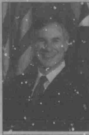
Greg Abbott Attorney General of Texas

Most divorced or never married parents recognize the importance of maintaining cordial relationships for the good of their children. They don't want their children to suffer because mom and dad can't get along.