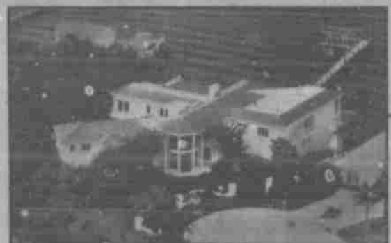
Photo caption #2: "Villa de Gloria" features an amazing 25,000-square-foot of living space and some 50-rooms, including a state-of-the-art movie theater.