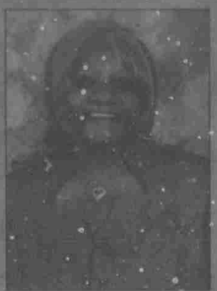
Fashion... Just for the fun of it. Fashion Tip... Always wear a smile.

hide and flatters the hips and a plunging wrap halter top emphasizes a great looking bust and waist. These swimsuits are tailored expressly to enhance your figure while keeping the focus on comfort, combining curve-friendly fashion with a fresh sense of style. Don't be shy ladies... make some waves!