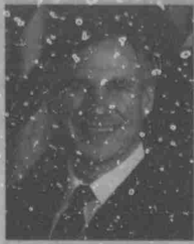
Greg Abbott Attorney General of Texas