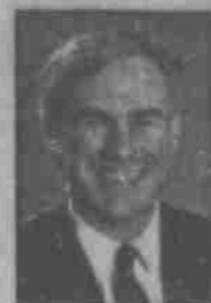
By Greg Abbott Attorney General of Texas

Our office has heard reports about unethical sales of living trusts. Some victims have paid as much as $1,800 for a living trust on the advice of door-to-door sales