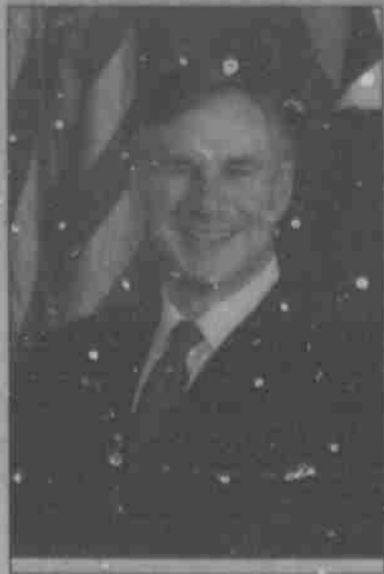
Greg Abbott Attorney General of Texas

Millions of credit card transactions take place every day. They are done in person, over the phone and on the Internet. While many credit card companies have instituted safeguards to protect against credit card fraud, the following are steps a consumer can