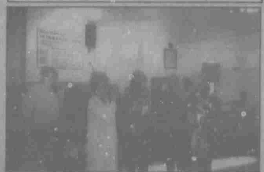
The Gospel Highlights