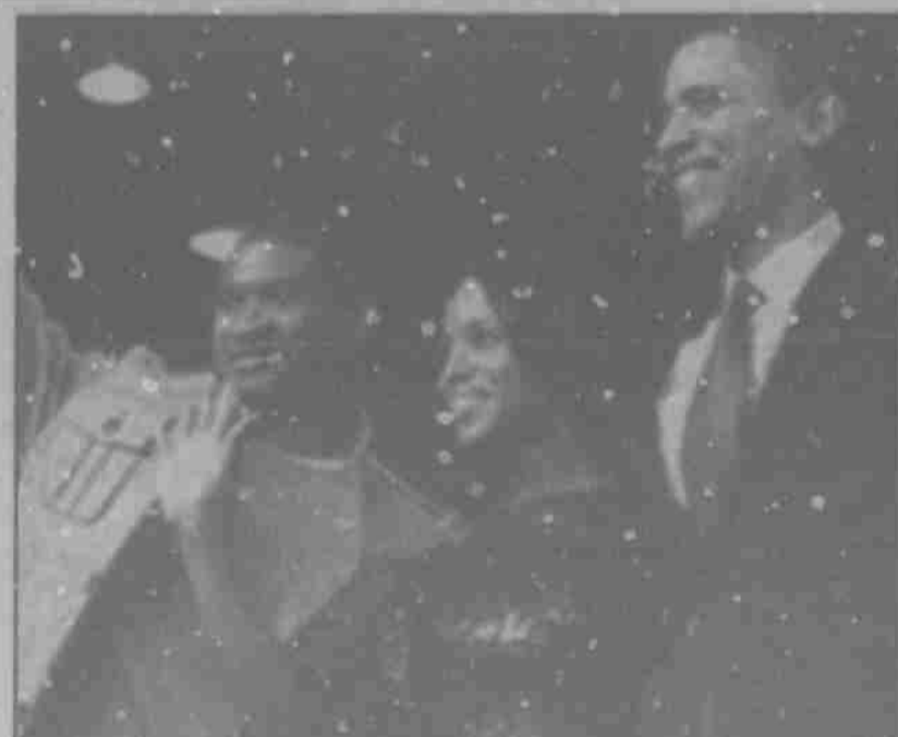
Obama got to see an actual rock star reception recently. Actually, it was for the celebrity trio of Usher, Kerry Washington and Chris Tucker, who surprised an audience at South Carolina State University by introducing the presidential candidate.

"Listen up, guys, listen up," Usher said, trying to silence them for a serious message. He said it would be negligent and irresponsible for them not to participate in Saturday's South Carolina primary. "If you don't use your voice,