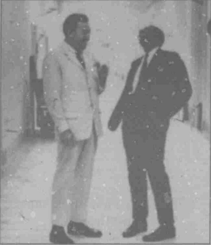
During the 1960's, these were trying times in the Black Community. Among those many active Black leaders included U. S. Congressman Adam Clayton Powell, Jr., left, and Stokely Carmichael in Washington, D. C. in 1966 at the National Museum of African American History and Culture which focused on people who battled injustice.