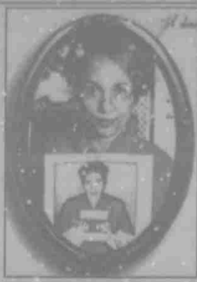
A Rose Among Thorns

The show moves onto the University of Santa Cruz, The Harlem School of the Arts sponsored by Woodie King, Jr., and Wayne State University in Detroit to close out the month of February. A Rose Among Thorns just completed a special encore performance sponsored by Omega Psi Phi at LA Southwest College Sat. Jan. 26, for parents and their children. The show is being booked beyond Black History Month.. Continue on Page 8