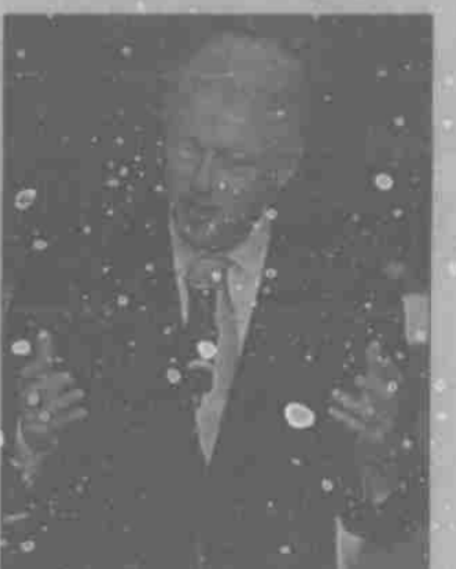
Former President Bill Clinton speaks during the funeral of civil rights activist Rosa Parks in Detroit, Michigan November 2, 2005.

The movement culminated in the 1964 Civil Rights Act and an end to segregation, but not without cost to Mrs. Parks, who was forced to leave Alabama for Detroit as a result of a hate campaign.