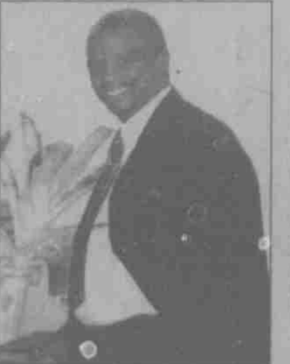
Lubbock youth had an opportunity this week to hear from a man who had much talk about drugs.