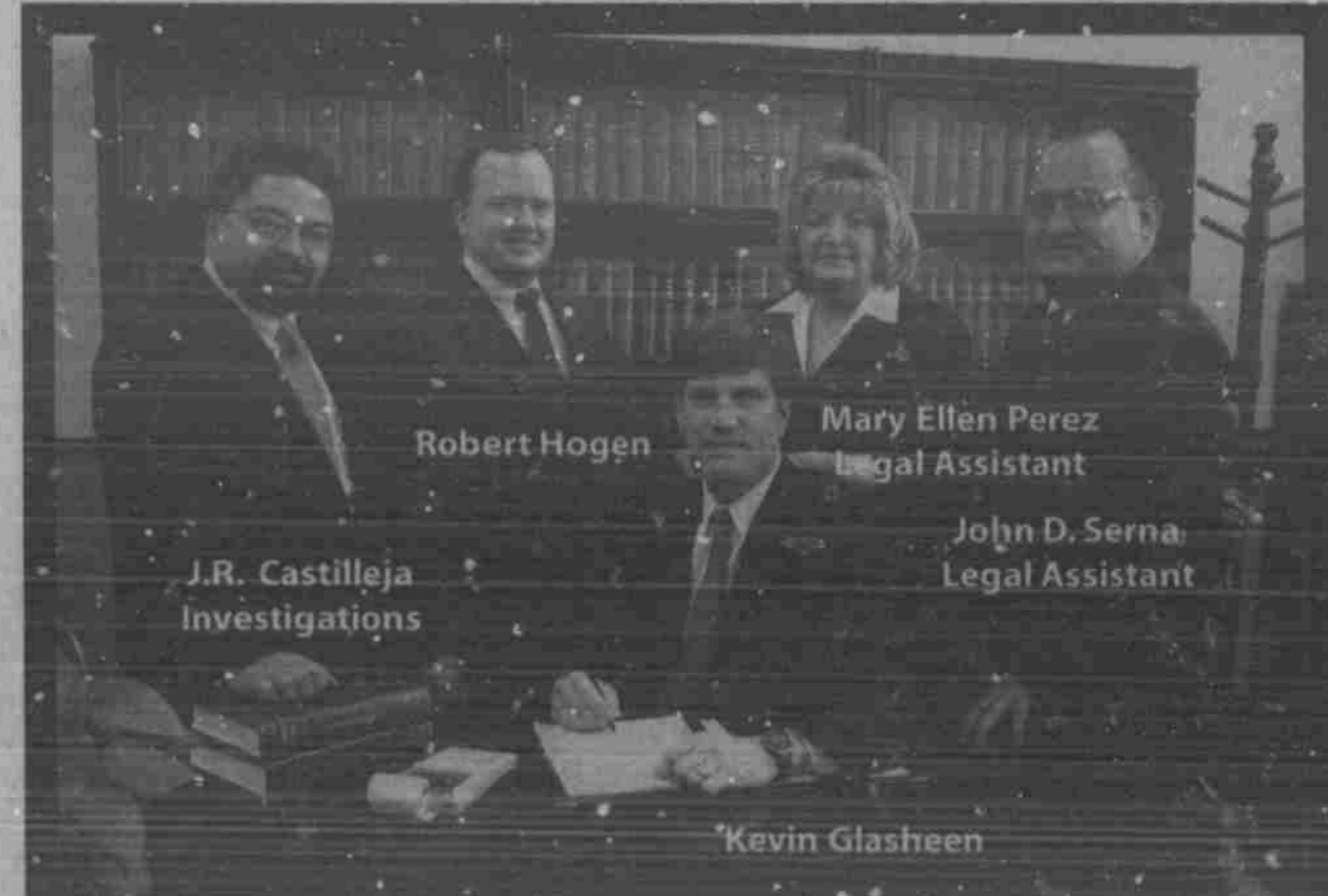
J.R. Castilleja Investigations

Where: Bobbie Gean and T.J. Patterson Library, 1836 Parkway