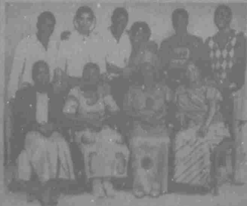
The Clintons and Rodhams were bad, but wait until this bunch starts running around the White House.