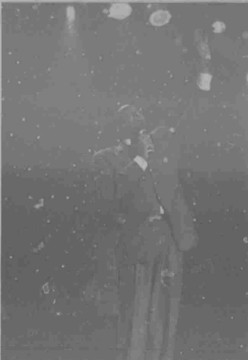
Gospel great Donnie McClurkin says he's cured of "the curse of homosexuality. I am delivered and I know God can deliver others, too," the Grammy-winning crooner said of his past dealings in same-sex relationships.