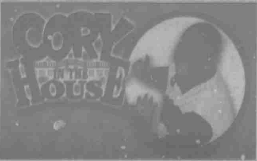
Kyle Massey stars in "Cory in the House" which premieres this weekend on the Disney Channel. The show is a spinoff of the hit show, "That's So Raven".

His biggest project to date was Disney's High School Musical which premiered on television in 2006 and became a hit smash and is still going strong.