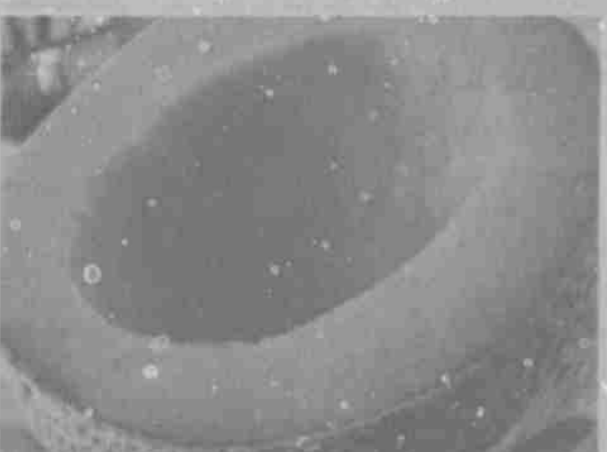
Fresh Cantaloupes Large & Sweet