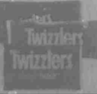
Twizzlers Licorice 10-18 oz., Select Varieties

CARD PRICE Save up to 11.99 on 10 with card