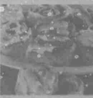
Iced Cinnamon Rolls 4-ct., Plain or Raisin

CARD PRICE Save up to 7.90 on 10 with card