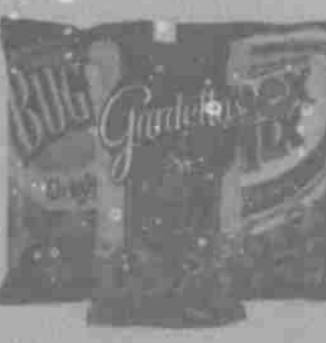
Garden of Eatin' Cheex Mix or Bugles Snacks 7.5-8.6 oz., Select Varieties

CARD PRICE Save up to 9.90 on 10 with card