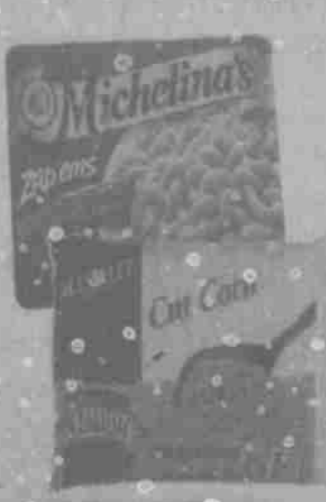
PictSweet Frozen Vegetables 16 oz. or Michelina's Entrees 5-8 oz., Select Varieties

CARD PRICE Save up to 2.30 on 10 with card