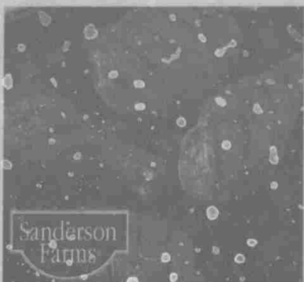
Sanderson Farms Wings, Drumsticks or Thighs, Family Pack or Whole Fresh Roaster Chickens All Natural

CARD PRICE Save up to 6.90 on 10 with card