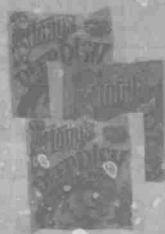
Tony's Deep Dish Pizzas 5.5-6.5 oz., Select Varieties

CARD PRICE Save up to 15.00 on 10 with card