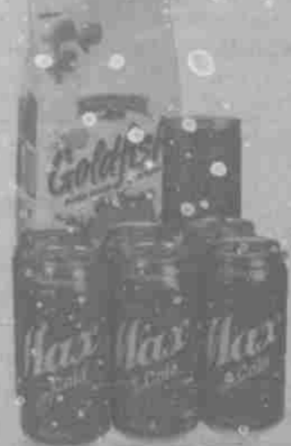
Albertsons Soda 6-pack, 12 oz. Cans, Max Velocity, Energy Drink 8.45 oz. Can or Pepperidge Farm Goldfish Crackers 6.6-8 oz., Select Varieties

CARD PRICE Save up to .90 on 10 with card