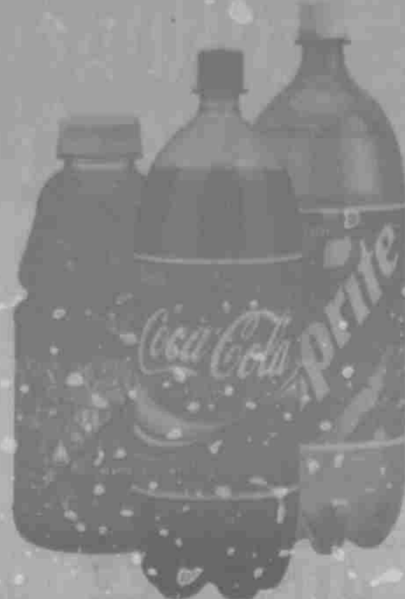
Coke or Sprite 2 liter Bottle, Gatorade Thirst Quencher 32 oz. or Gatorade Endurance 34 oz., Select Varieties

CARD PRICE Save up to 8.90 on 10 with card