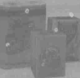
Puffs Facial Tissue 64-100 ct. or Albertsons Soft Choice Bath Towels 4 Rolls, Select Varieties

CARD PRICE Save up to 13.99 on 10 with card