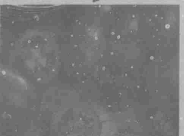
Fresh Roma Tomatoes Red, Ripe

CARD PRICE Save up to 18.90 on 10 with card