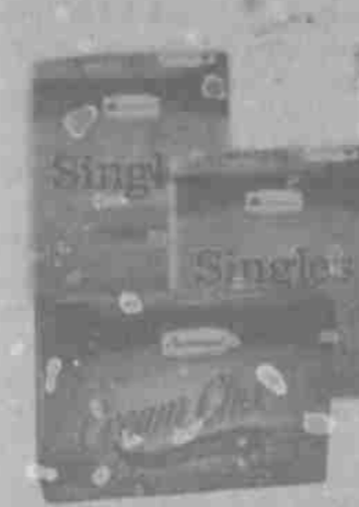
Albertsons Cream Cheese or American Singles 8-oz., Select Varieties

CARD PRICE Save up to 7.90 on 10 with card