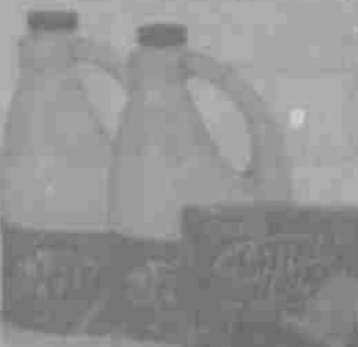
Albertsons Simply Clean Ultra Bleach 96 oz. or Sweeper Cloths 15-ct., Select Varieties

CARD PRICE Save up to 9.90 on 10 with card