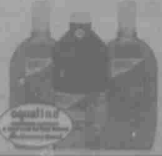
equaline Styling Gel 16 oz. or 28.3-42.8-oz. Aerosol, Select Varieties

CARD PRICE Save up to 6.99 on 10 with card