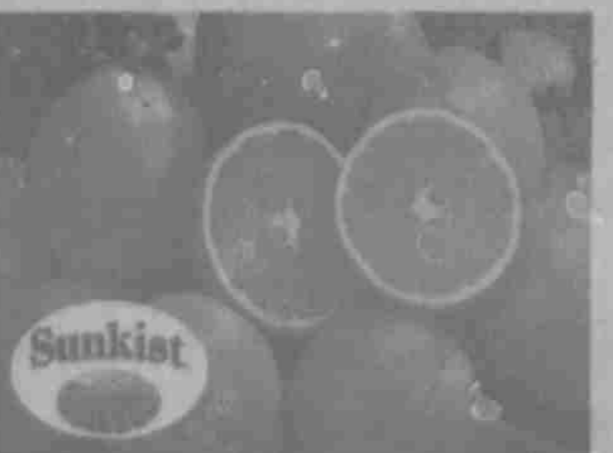
Sunkist California Oranges 4 lb. Bag, New Crop

CARD PRICE Save up to 5.90 on 10 with card