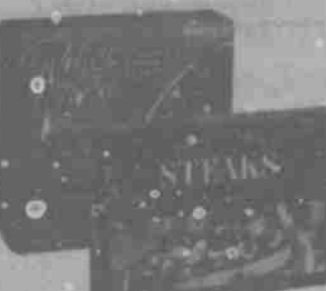
Philly-Gourmet Sandwich Steaks or Maria Lucia Meatballs 11.2-15 oz., Select Varieties

CARD PRICE Save up to 5.90 on 10 with card