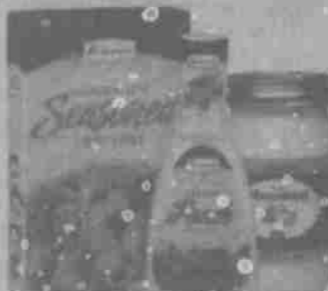
Albertsons Salad Dressing, Mayonnaise 16 oz. or Creams 16 oz., Select Varieties

CARD PRICE Save up to 29.90 on 10 with card