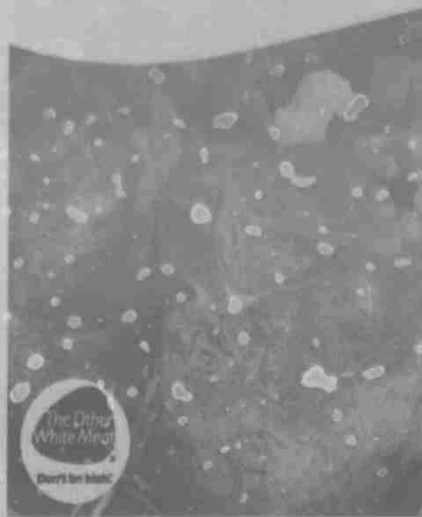
Assorted Pork Loin Chops Family Pack