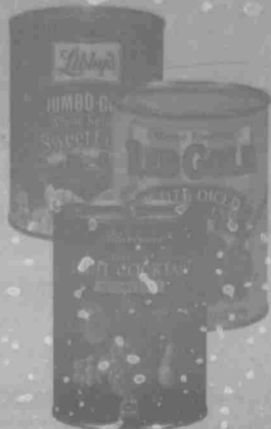
Albertsons Canned Fruit, Libby's Vegetables or Red Gold Potatoes 28-30 oz., Select Varieties

CARD PRICE Save up to 9.90 on 10 with card