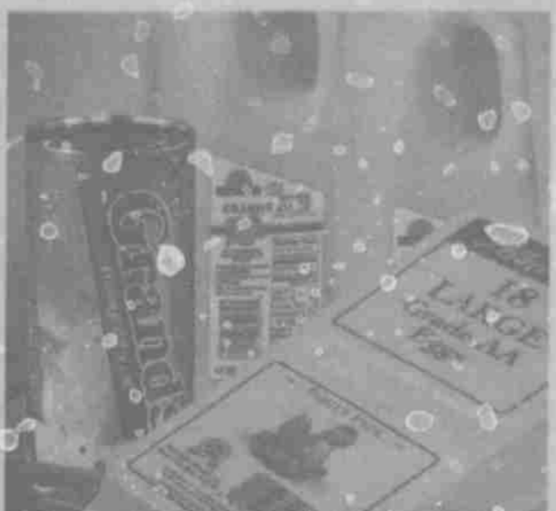
Albertsons Large Eggs 18-ct., Good Day Orange Juice 64 oz. or Grand! Biscuits 16.3 oz., Select Varieties

CARD PRICE Save up to 14.90 on 10 lbs. with card