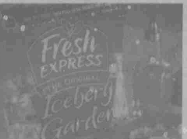
Fresh Express Garden Salad 1 lb. Bag