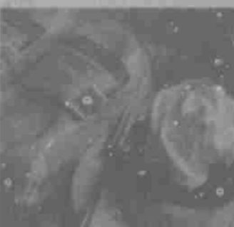
Albertsons Dessert Cups 4-ct., Ready for Fresh Berries

CARD PRICE Save up to 14.99 on 10 with card