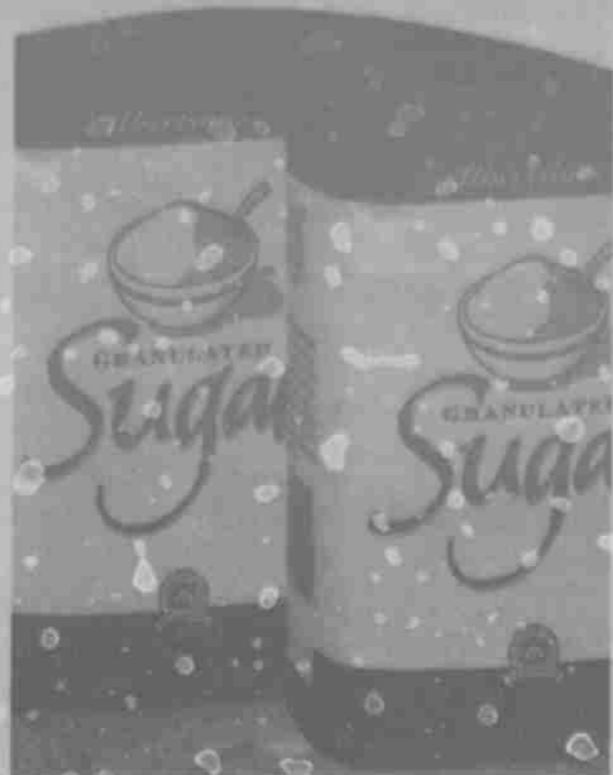
Albertsons Granulated Sugar 4 lb. Bag Limit 10

CARD PRICE Save up to 9.90 on 10 lbs. with card