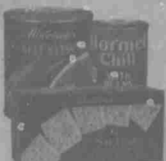
Hormel Chili 15 oz. Beef Stew 24 oz. or Albertsons Salsas 15-16 oz., Select Varieties

CARD PRICE Save up to 15.99 on 10 with card