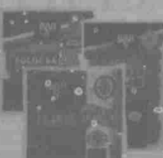
Bar-S Meat Bologna, Franks or Smoked Sausages 12-16 oz.

CARD PRICE Save up to 11.99 on 10 with card