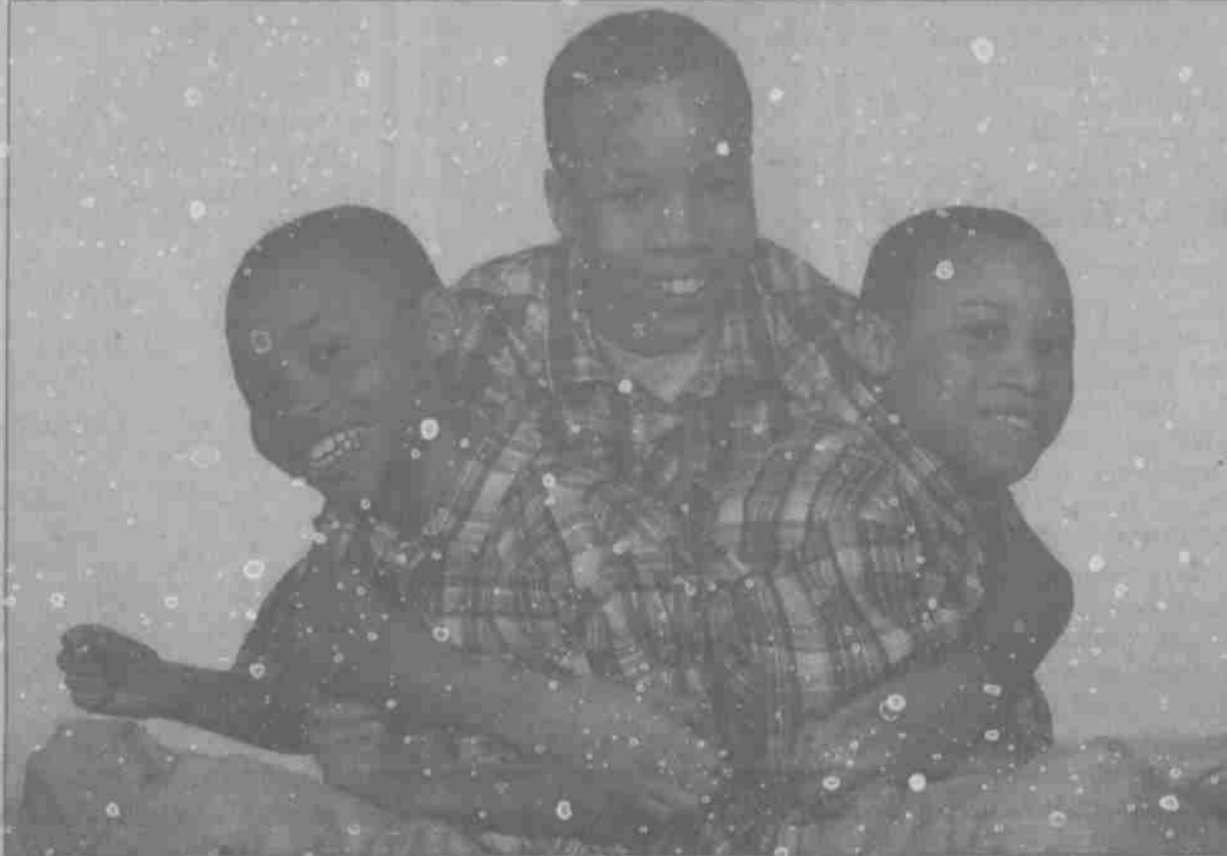
Campaign urges parents to find out if their uninsured children are eligible for low-cost or free coverage.