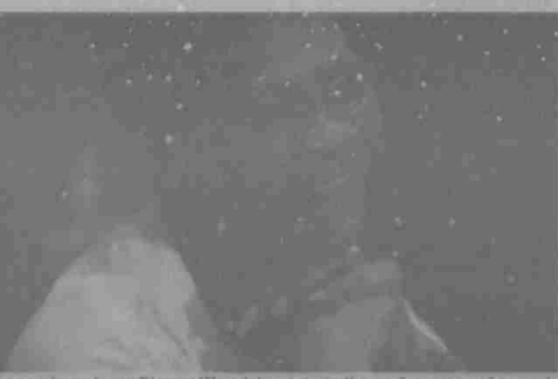
Legendary singer Dionne Warwick reacts to the performance of a musical featuring her songs. The show is scheduled to run through the first part of October.

bly moved Warwick took the stage to speak to the cast.