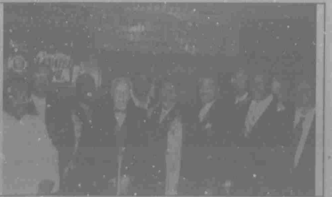
Officers and members of the 100 Black Men of West Texas during their annual program last month.