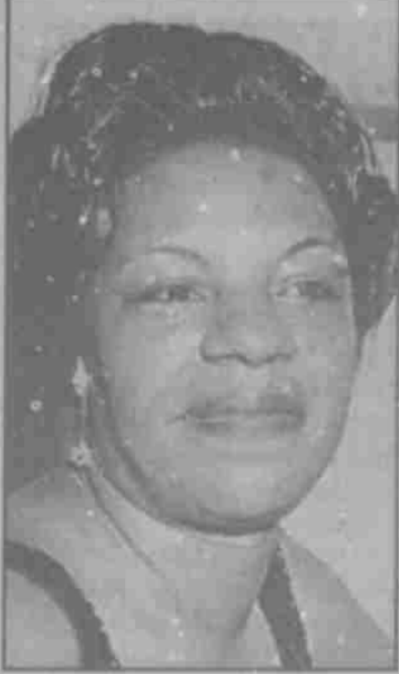
5 great-great-grandchildren; and a host of other relatives and friends.