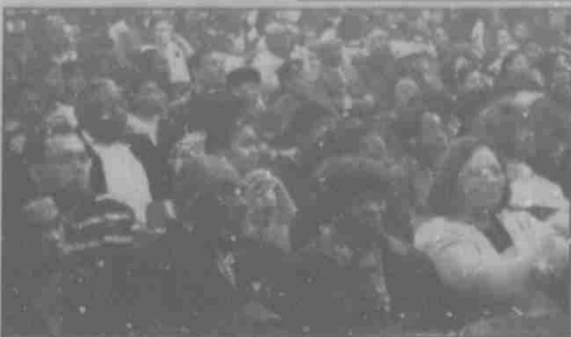
A Portion Of Crowd At Lake Ridge United Methodist Church