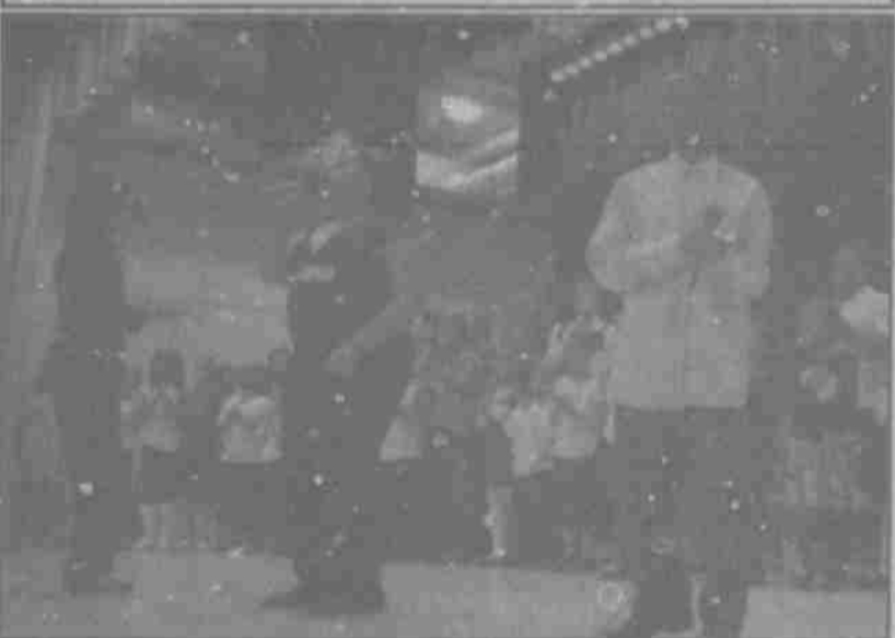
How About These Young People? We Are All Very Proud!