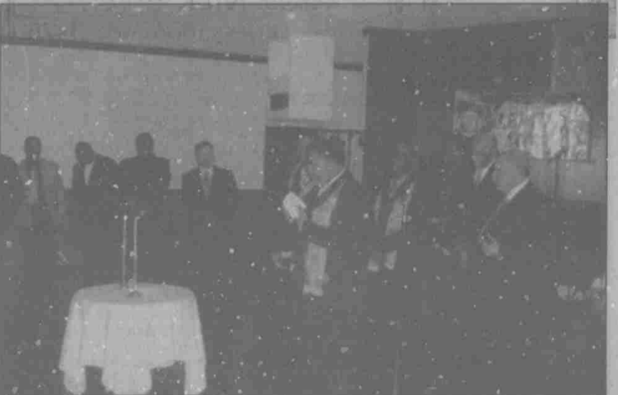
Brothers of the 100 Black Men of West Texas are shown going through one of their rituals during a recent program. It was their Annual Gala.