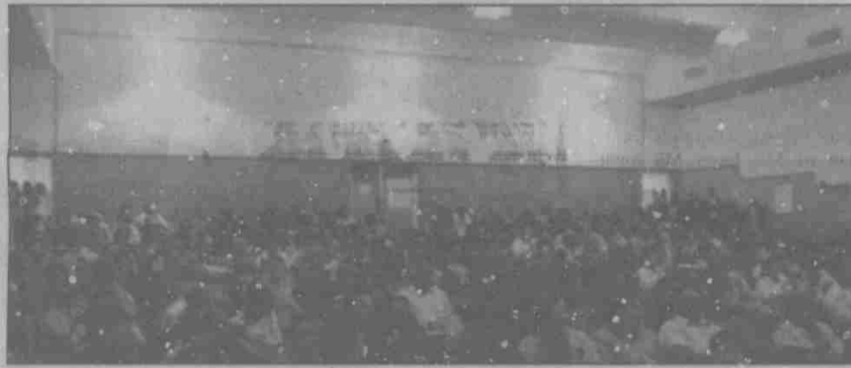
A Glimpse Of Large Crowd At Alderson Middle School Last Saturday Night!

GOSPEL FEST 2008 BLACK TIE AFFAIR PRESENT BY EACH ONE REACH ONE BRIDGING THE GAP INC.