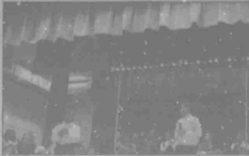
Some Very Talented Young People Performing!

A special thanks to all the young people who participated!