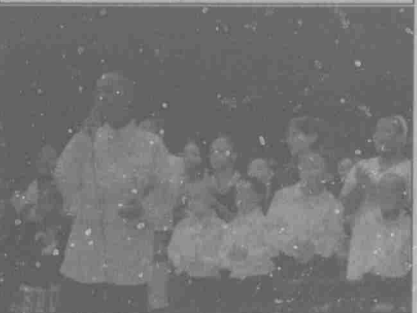
Young People Singing, Because They Love To Sing!