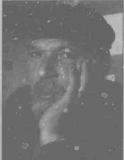
Award-winning playwright August Wilson died Sunday surrounded by family members in Seattle.

African-American artist, he broke numerous barriers and raised the bar for excellence; as a leader in his field, he raised vital issues concerning the role of black playwrighting and production in the broader American theatrical mainstream.