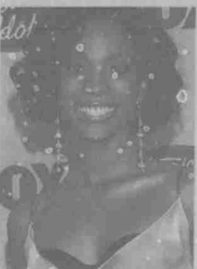
Tamyra Gray has had several acting roles since her appearance on American Idol, but hasn't given up on her dream of being a singer. She appears in the upcoming movie "Gospel," opening this weekend.

Her untimely exit from 'American Idol' made Tamyra Gray a household name. Now the former Miss Atlanta wants to captivate audiences with her acting as well as her singing. The recently engaged entertainer — she won't say to whom — gives an impressive performance for her feature film debut in the Sony Screen Gems/Rainforest Pictures film, 'The Gospel,' a role that allows her to showcase both her singing and acting abilities. "It's always nice to be able to showcase what it is you do first, in something that you're trying to venture out into. What I hope, in the long run, is to achieve roles that don't have singing," said Gray, during our conversation at Atlanta's The Ritz-Carlton Buckhead hotel.