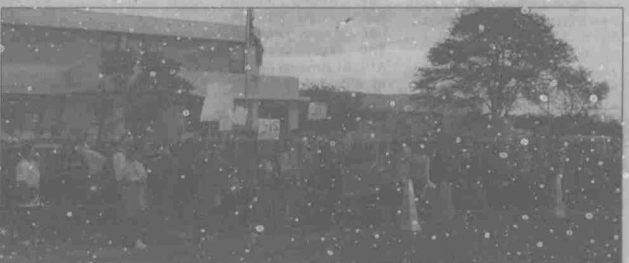
Over 300 students joined in a student led demonstration to keep their school open. Lubbock independent School Administrators presented a proposal to convert O.L. Slaton into a center for performing arts and vocations.

An O.L. Slaton student from the neighborhood pauses as the students gathered at 7:45 a.m. Collectively, neighborhood and magnet students asked that their school be sustained. However historically, most of the school closings that have occurred in Lubbock have been located in North and East Lubbock.