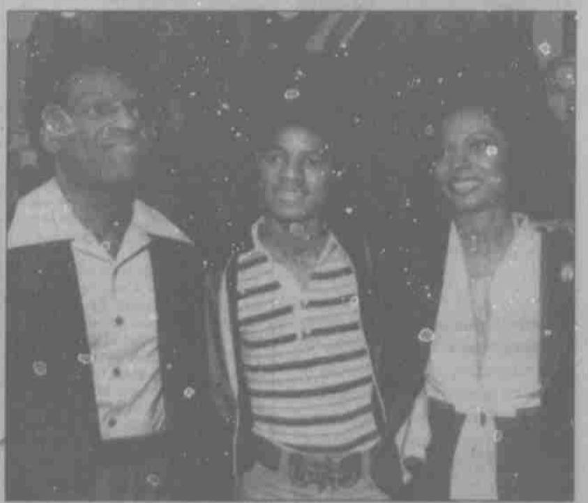
Stars of the 'The Wiz,' a film adaptation of the Broadway musical of the same title, pose at a news conference in New York City, Sept. 28, 1977. From left are, Nipsey Russell, Michael Jackson, and Diana Ross. One of Russell's notable roles was playing the Tin Man alongside Ross and Jackson in 'The Wiz'.