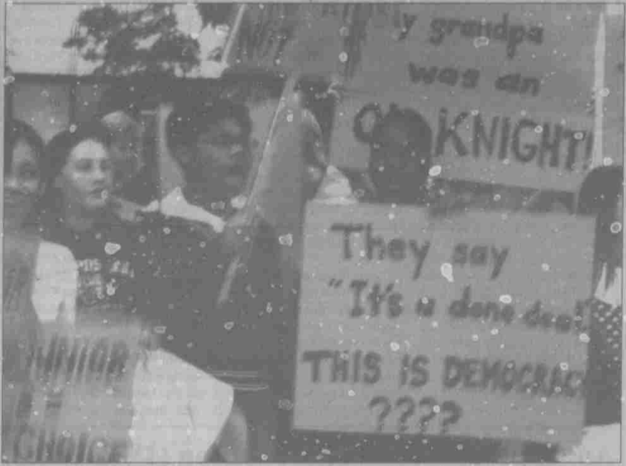
O.L. Slaton students held up signs and chanted to keep their school open Friday morning during a peaceful demonstration in front of the school.