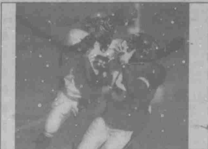
Estacado MATadors Returning To Play-Offs, Player is Catching a Pass on November 13, 2007.