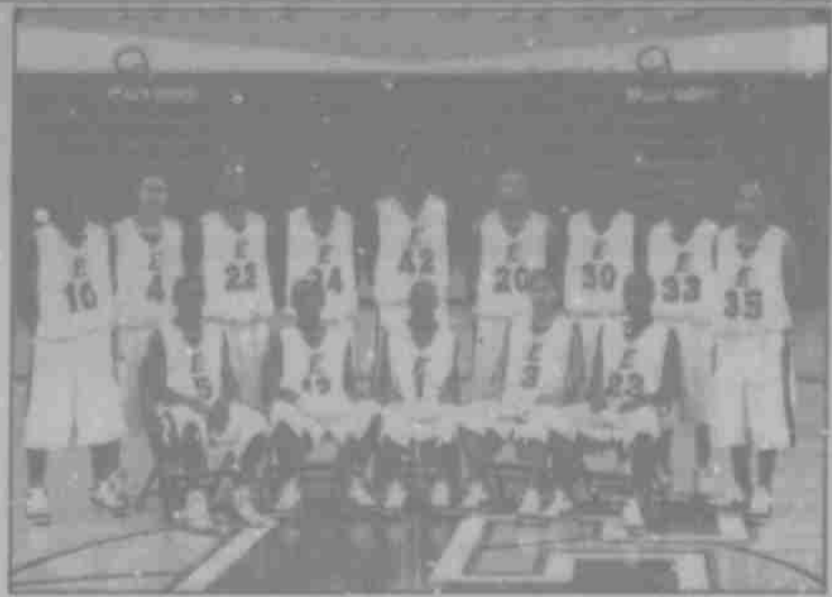
The Mighty Estacado High School Basketball Team is shown getting Ready For the 2007-2008 Season. They are Expected to Do Well this Season. Estacado High School fans are asked to support the Matadors. They will be looking forward to seeing you present at their games. Go Matadors!