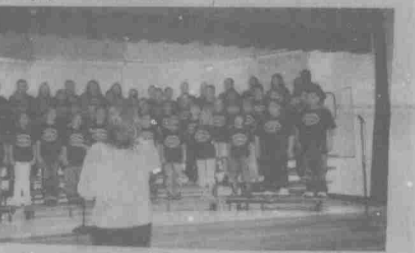
Students in the Roy Roberts Elementary School Choir performed at the reception.