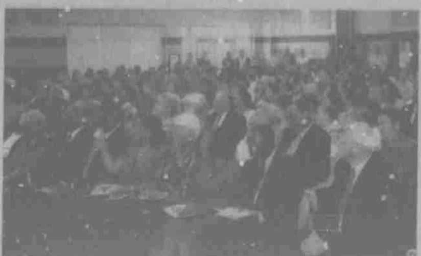
A crowd estimated at over 300 people came out for the dedication of the Roy W. Roberts Elementary School.

Some of the members of the church feel the 82nd Church Anniversary is a celebration of faith, as it commemorates a milestone of over eighty years of blessings. They are quick to