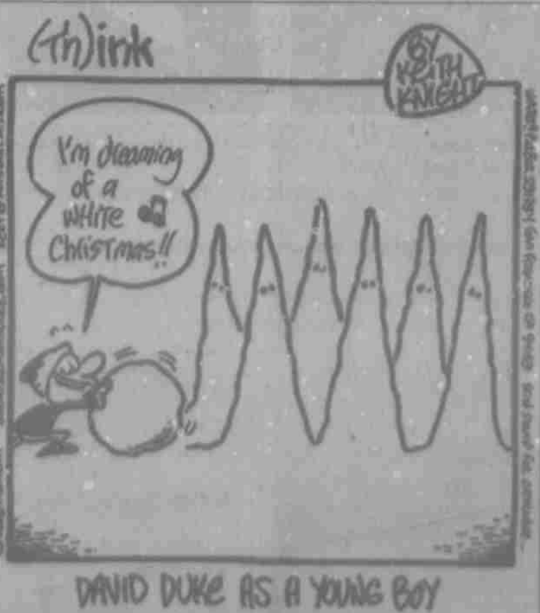
DAVID DUKE AS A YOUNG BOY

You can also email us at: swdigest@abeglobal.net or fax your letter to (806) 762-4605