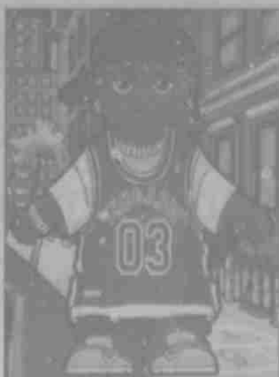
D-Roc is the main character in the Thugaboo series, along with his sister, Dee Dee and other neighborhood friends. Thugaboo is often compared to Bill Cosby's Fat Albert characters.

When asked about their source of inspiration Shawn Wayans answered, "We were inspired by some of our favorite cartoons as kids, and wanted to bring something special to a