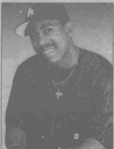
Kurtis Walker, also known as hip-hop pioneer Kurtis Blow, is founder of both the Hip Hop Church and Hip Hop eMass. "It's not that I'm trying to bring hip-hop into the church," says Walker. "I'm trying to bring God into hip-hop."