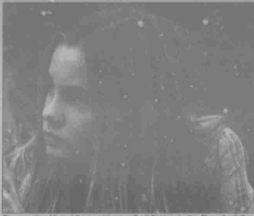
Texas native Liana Liberato stars as Cadi Forbes in the film adaptation of the best-selling book, The Sin Eater . The movie is set to open in theaters on February 16.

CENTURY CITY, CA - A young girl begins a journey to seek out the one man who can save her soul in The Last Sin Eater , coming to theaters on February 16, 2007. "Enlightening while entertaining" (Baptist Press), The Last Sin Eater explores a community in the Appalachians that practice the belief that a human "sin eater" can discharge the dead of their sins and a young girl preoccupied by her own sense of guilt and mortality, driven to uncover the truth behind the long held tradition. Directed by Michael Landon Jr. and starring Academy Award Winner and Emmy Nominee Louise Fletcher and two-time Golden Globe Nominee Henry Thomas, The Last Sin Eater is based on the award winning novel by Francine Rivers. The Last Sin Eater , marketed by Fox Faith and distributed by The Bigger Picture, can be seen in theaters in more than 128 U.S. and Canadian cities, showing on over 500 screens. Locations and theater information are available at FoxFaithMovies.com .