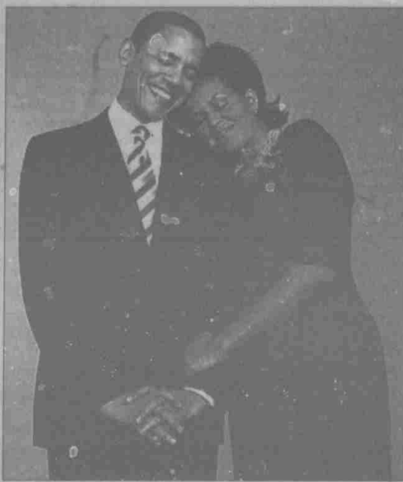
Barack Obama and wife Michelle

Also in this issue, EBONY celebrates Black fashion designers in Sartorial Splendor, with an