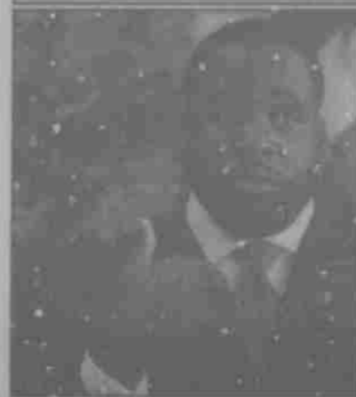
Detroit Mayor Kwame Kilpatrick's

For more information on fostering or adoption, call (806) 762-2680 or visit www.adoptchildren.org