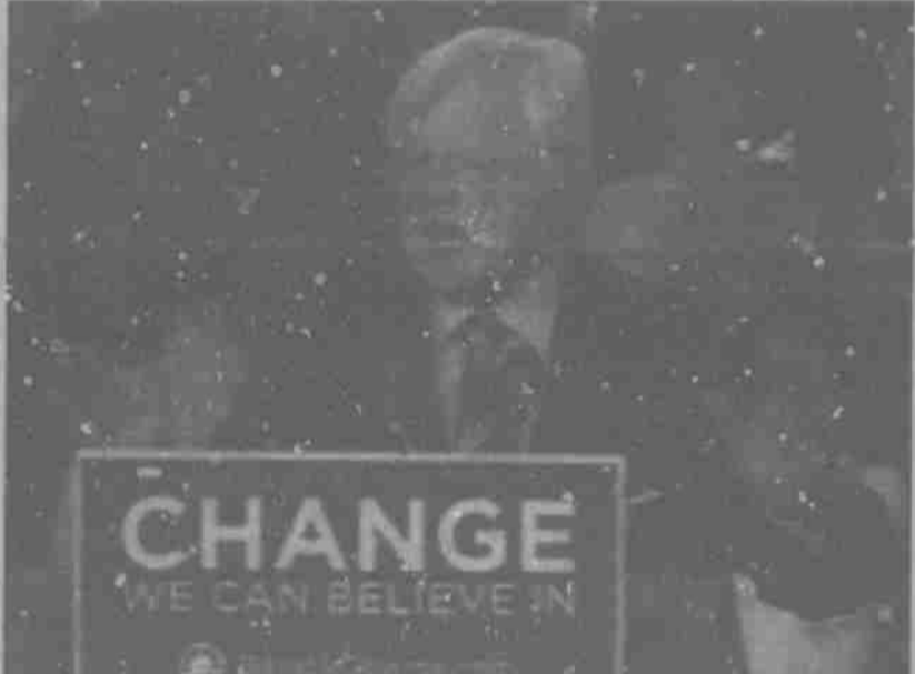
Ted Kennedy formally endorsed Obama Monday.

The senator — a fixture of the Democratic Party popular with many liberals — was joined by his son, Rep. Patrick Kennedy of Rhode Island, and by Caroline Kennedy, who thought back to her father, the slain president. She said Obama offers the "sense of hope and inspiration" that young people today need. In fact, she said, her children "were the first people who made me realize Barack Obama is the president we