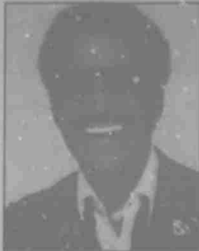
Sammy Davis, Jr.