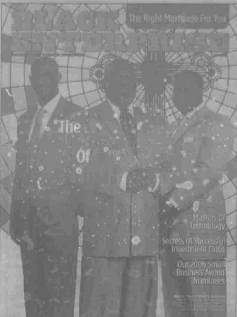
Pastor Kirbyjon Caldwell and Bishops T.D. Jakes and Eddie L. Long have impacted the media/religious atmosphere in America.

into high-profile CEOs of multimillion-dollar enterprises. In the May issue's special report, "The Business of Faith," BLACK ENTERPRISE (BE) conducts exclusive interviews with cover subjects Pastor Kirbyjon Caldwell and Bishops T.D. Jakes and Eddie L. Long—religious leaders who have embraced business in a big way—often facing criticism—to further their church mission, spiritual message, and entrepreneurial aspirations.