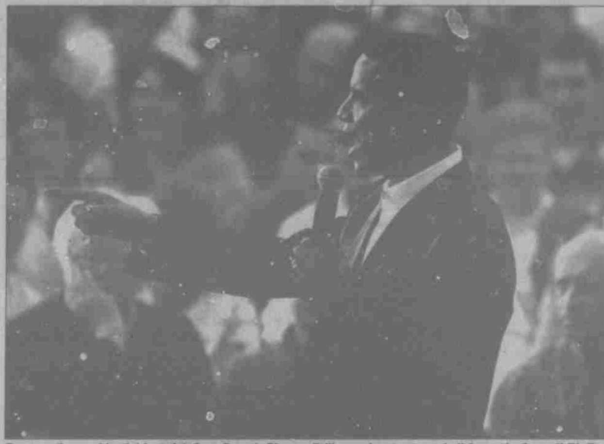
Democratic presidential hopeful, Sen. Barack Obama, D-Ill., speaks at a town hall forum in Council Bluffs, Neb., Saturday, March 31, 2007.

Obama's strong showing was a blow to Clinton, who sought to position herself as her party's strongest White House contender in part through her fundraising prowess. She has spent years devel-