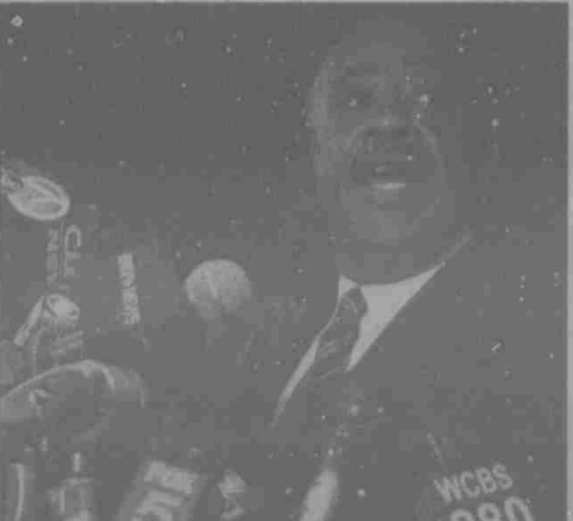
Rev. Al Sharpton will stage a March of Decency at the offices of New York record companies on May 3, 2007.