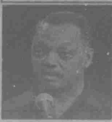
Rev. Jesse Jackson

CHICAGO (AP) — The Rev. Jesse Jackson apologized Wednesday to Barack Obama for making a "regretfully crude" comment about the Democratic presidential hopeful during what he thought was a private conversation three days ago.