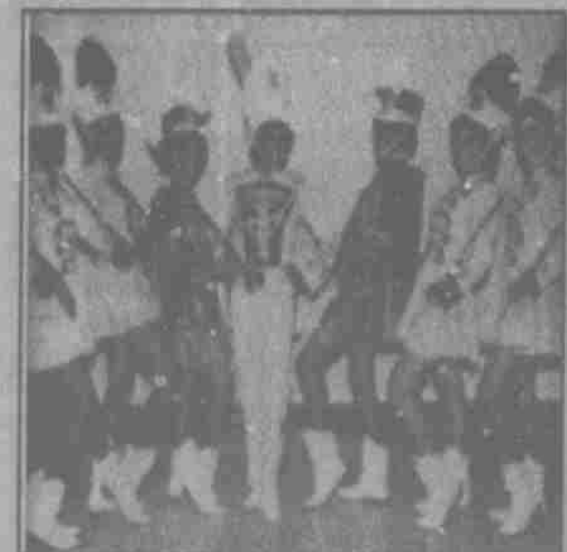
The Dunbar Panther Band could not be complete in 1963 without the drum major and majorettes to lead the band's march down the field.