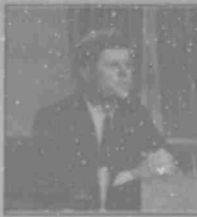
President Kennedy urged civil rights in 1963. An Ohio community was discriminated against from 1956 to 2003.

COLUMBUS, Ohio (AP) - Residents of a mostly black neighborhood in rural Ohio were awarded nearly $11 million Thursday by a federal jury that found local authorities denied them public water service for decades out of racial discrimination.