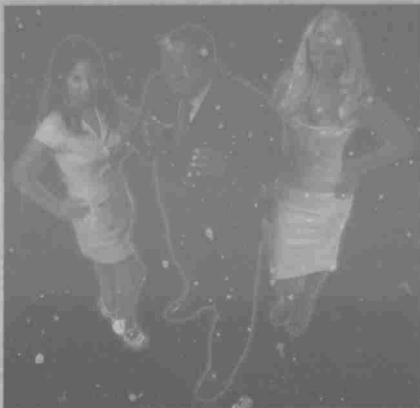
Lucy Liu, Cedric the Entertainer and Nicolette Sheridan star in Official Code Name: The Cleaner .

For instance, when Jake is offered a job as an FBI Agent, he declines, opting to remain a janitor because "Somebody needs to keep this place clean. That's what I do." Yet, he is simultaneously shown to have a serious