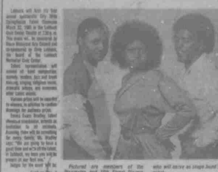
Featured are members of the Playmakers and 15th Street Players who will arrive on stage hand for the event.