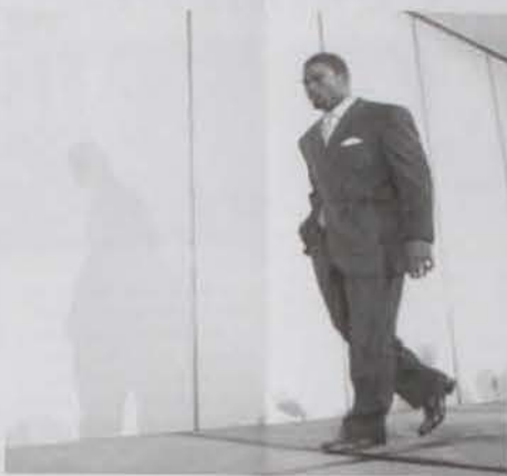
Michael Vick has signed on to work at the Boys and Girls Club, which is a definite step in the right direction. Suspended NFL quarterback Michael Vick is leaving his federally ordered construction job and is working for the Boys & Girls clubs in the Hampton Roads area of Virginia.