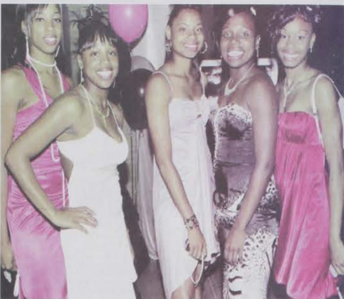
WHO ARE THESE YOUNG ATTRACTIVE BLACK SISTERS? If there is someone who thinks they can identify all of these young ladies, let us hear from you. If you are correct, with all of them then you will receive a FREE subscription to the Southwest Digest. Send your answer to: Attractive Black Sisters, Southwest Digest, P. O. Box 2553, Lubbock, Texas 79408.