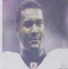
Steve McNair, 36, spent 13 seasons in the NFL, the majority with the Tennessee Titans.