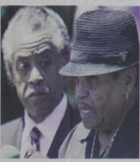
Joe Jackson with family friend Al Sharpton

Since Michael Jackson died Thursday of what his family has said was cardiac arrest, his father has been vocal about his son and the posthumous arrangements being made. Medical examiners in Los Angeles are perhaps weeks away from officially determining the cause of death, though a second autopsy has been