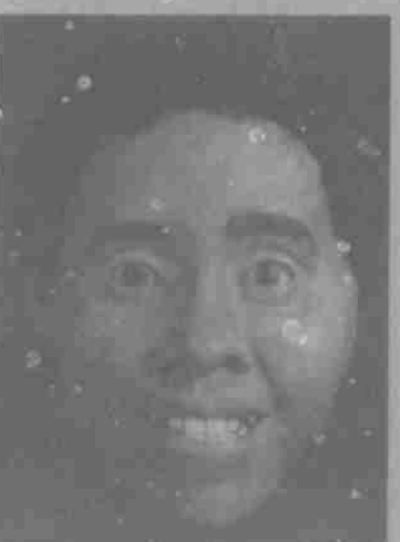
An artist's rendering of remains found near Yellow House Canyon in December 2005.

The unidentified boy is between 5 feet 6 inches and 5 feet 9 inches tall and is likely between 160