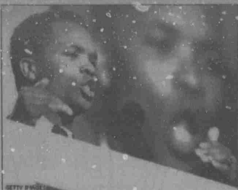
Jesse Jackson Jr. says he is confident he "engaged in no wrongdoing."

"In the days ahead, federal law enforcement officials want to meet and discuss what I know about the Senate selection process," Jackson said. "I look forward to cooperating with the hardworking men and women of the United States Attorney's Office and the Justice Department."