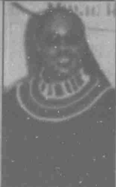
reflect life in the United States."

"The Gershwin Prize was created to honor an artist whose creative output transcends distinctions between musical styles and idioms, bringing diverse listeners together, and fostering mutual understanding and appreciation," said Librarian of Congress James H. Billington. "Stevie Wonder's music epitomizes this ideal." In 2005, the Library of Congress added Stevie Wonder's 1976 double album "Songs in the Key of Life" to the national Recording Registry, which recognizes recording that are "culturally, historically or aesthetically important, and/or inform or