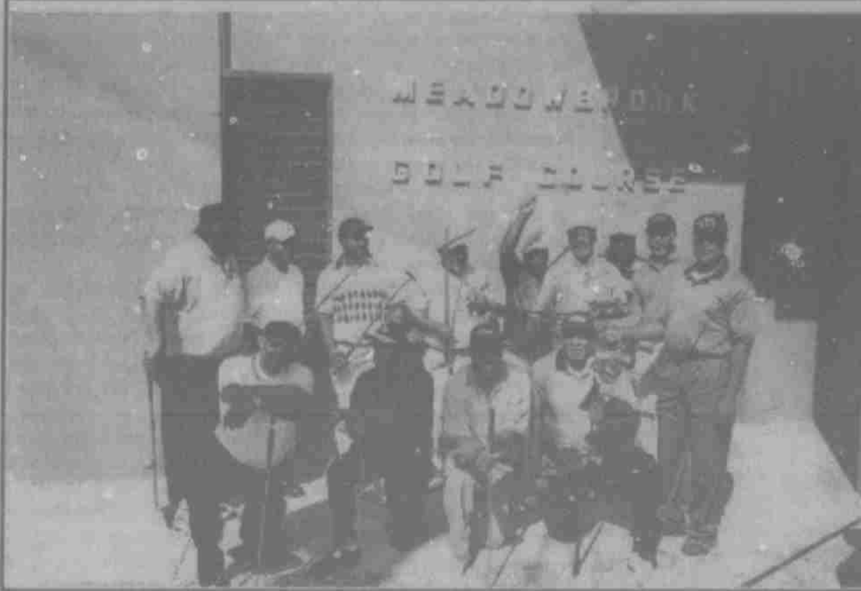
Proud Members of The Kango Golf Association

The Kango Golf Association has been a member of the Texas State Amateur Golf Association for six years.