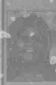
Jewelry plays an important part in the appearance of any fashion outfit and your options are unlimited. Jewelry is personal and all about freedom, wear as little as you

like or as much as you like, and at a time or all at once. Today's jewelry is designed fashionably fit the mind and body, designed with parts that move and swing when you do. This fall, let your imagination run wild, wild and free. So ladies, go for it! Gold chains, silver chains, bangles, necklaces long or short, keep in mind that with your jewelry you can juggle it, chain it, bunch it, mix it or match it, and remember that choices are high on the fashion list.