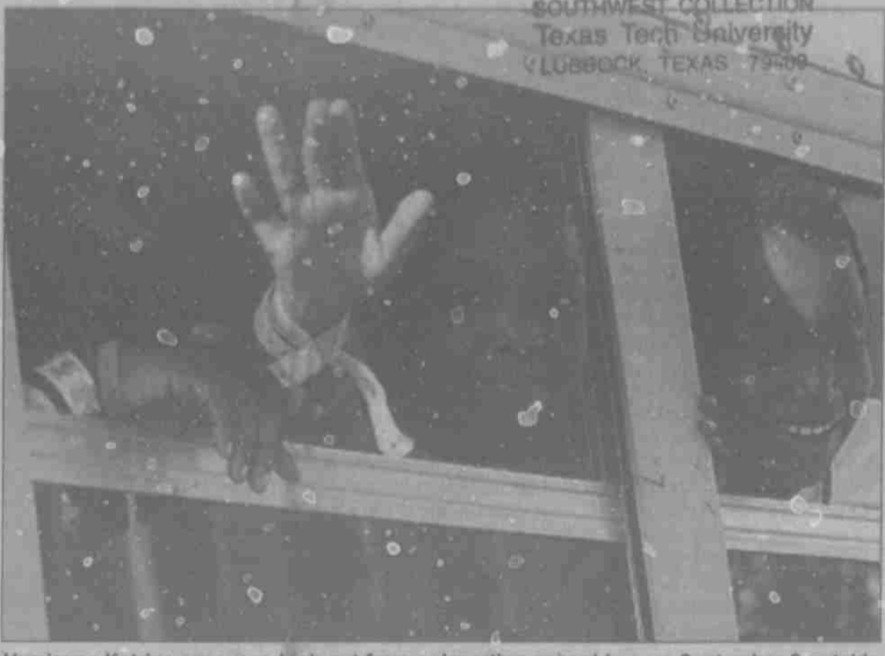
Hurricane Katrina evacuees look out from a departing school bus on September 8 outside the Reliant Center in Houston, Texas. The crippled city of New Orleans appealed to US President George W. Bush for urgent financial aid to help it reopen its schools and rebuild its shattered education system.

"The pathetic thing in this case was that they were asked if they wanted to move them and they did not," Fott said. "They were warned repeatedly that this storm was coming. In effect, their inaction resulted