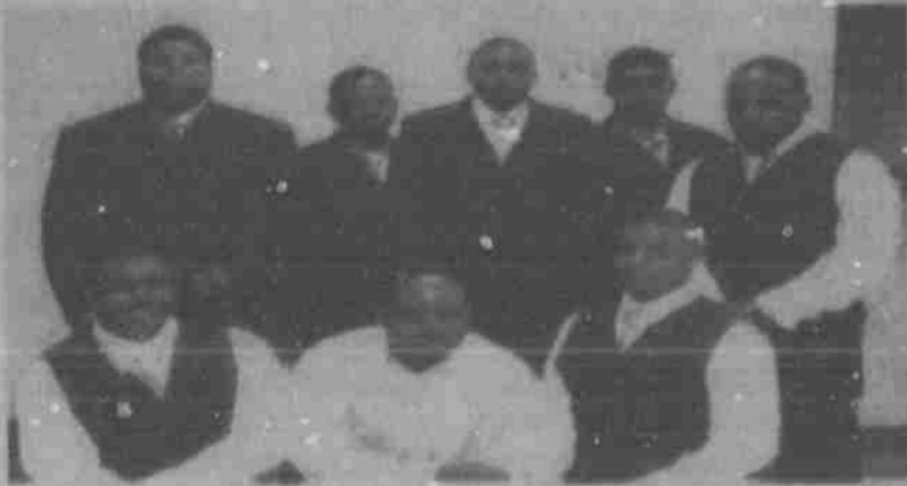
Buddy & The Straightway Traveler