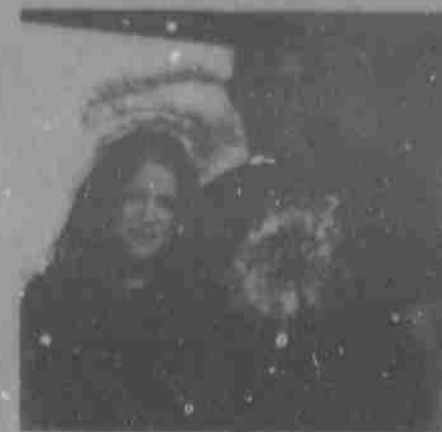
Lamar Odom and Khloe Kardashian

Derek Fisher each had their publicists run interference with the hoard of reporters, photographers and TV cameramen.