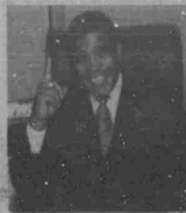
Don Hill Former Mayor Pro Tem

By 10:40 a.m., the courtroom was packed. U.S. District Judge