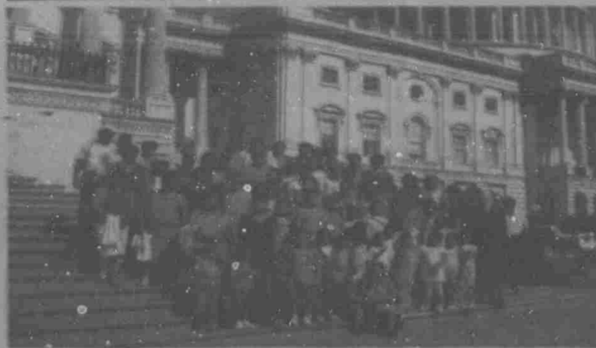
Greater St. Luke Missionary Baptist Church of Lubbock, Texas tours Washington, D. C. and takes photo on the steps of the U. S. Capitol Building June 24, 2009 with Congressman Randy Neugebauer.