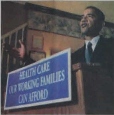
President Barack Obama

Members of the Asian caucus, along with the Congressional Black Caucus and the Congressional Hispanic Caucus, said they plan to introduce legislation this week that includes their wish list for broadening health care overhaul beyond various plans floated in the House and Senate. The three minority caucuses have a total of 91 members, most of them Democrats and enough to help shape the final legislation.