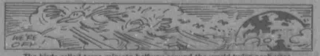
The birds called terns migrate halfway around the world twice each year.