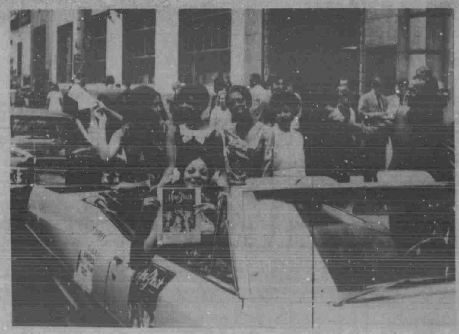
Miss Black America Parade 1986