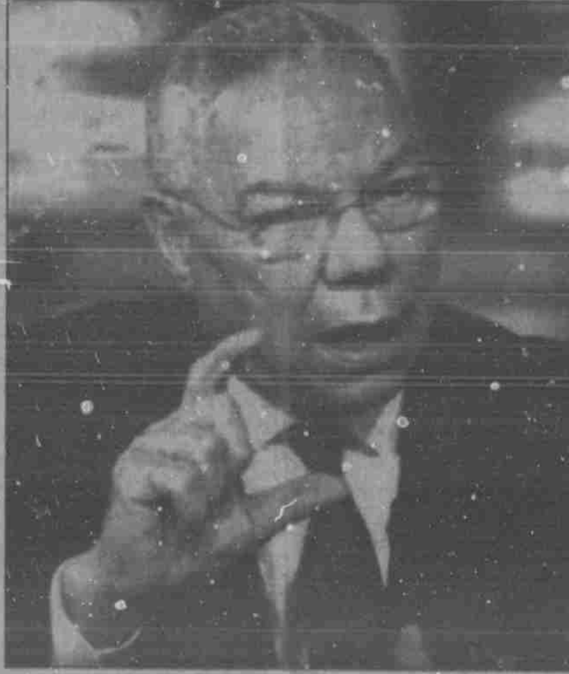
Colin Powell, Former Secretary of State

CLEDO, Ohio — Barack Obama found out about Colin Powell's endorsement in the same way as the rest of America: He tuned in to "Meet the Press." "We didn't have any conversations with him," chief strategist David Axelrod said Sunday, describing Obama as "dumb" after watching the endorsement from his hotel room in Durham, N.C. "It was purely Powell, on his own timetable and his own initiative." Obama, said Axelrod, views Powell as "a singular presence in American life. ... For people who are still deciding, I think he laid out a case that will be meaningful to them. Independents, disaffected Republicans — there are more and more of those." The role Powell might take in the next two weeks is unclear, Axelrod said. "We'd love to have him out of the campaign trail, we would love to have him on TV, but if he does not one more thing, he will have done us a great service." The endorsement goes a ways toward insulating Obama from accusations that he's a