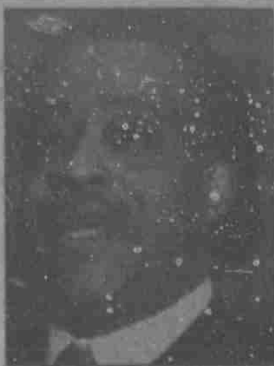
Rev. Al Sharpton

Sharpton testified Monday that the protests were peaceful, saying: "We wanted to stop vio-