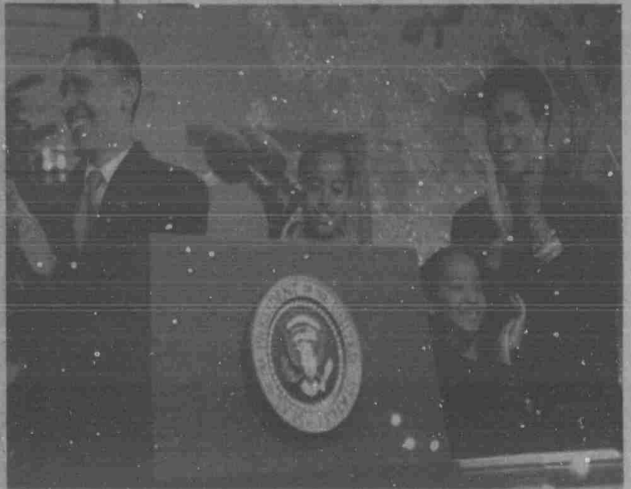
U.S. President Barack Obama (L), First Lady Michelle Obama (R), and their daughters Malia (2nd L) and Sasha participate in the National Christmas Tree Lighting ceremony on the Ellipse near the White House in Washington on December 3, 2009.

Way's Campaign Volunteer of the Year in 2007.