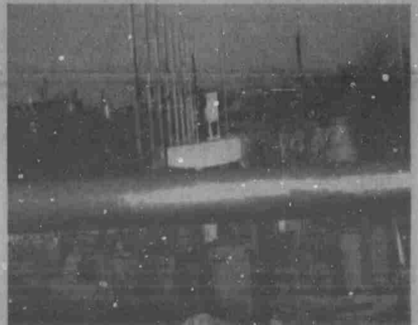
Lubbock has its share of homeless. Just take a look at this photo taken of people living near the Mae Simmons Swimming Pool, just north of the overpass when you are driving over it. There are also numbers of persons, who are homeless living around the Mahon Library after dark.

This photo reminds all of us of what the recession has done to the United States of America. So as we celebrate the Christmas Holidays, let's not forget why we celebrate.