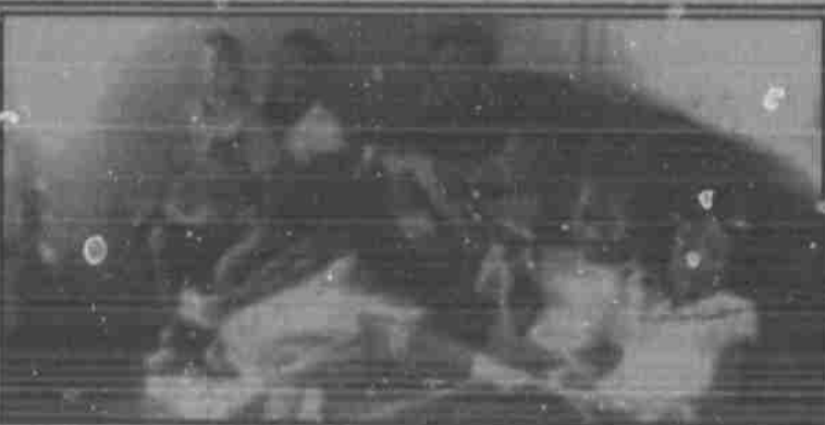
"We enjoy Theodore Phea Boys and Girls Club"