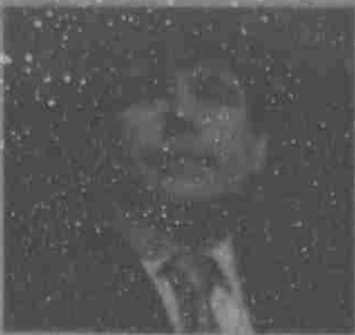
Rod Blagojevich is currently serving his second term as governor of Illinois.

we all move in the same direction .... one area will move ahead of the other areas... EAST LUBBOCK .... Will continue to grow as other parts of Lubbock.... THIS N THAT ..... really believes something good will happen in .... EAST LUBBOCK.... As one person has said .... "A SWINGING DOOR MUST COME BACK!"