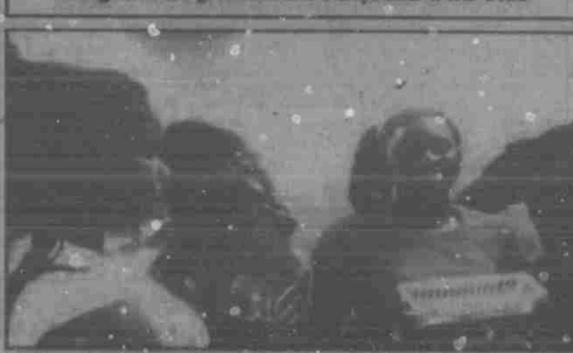
"It's a good place to visit with your friends"

ACT and SAT. The club also has staff and volunteers that will tutor students on passing these tests as well.