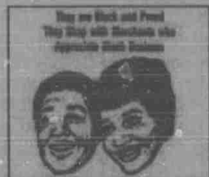
They are back and proud. They stay with Momma who appreciates their smiles.