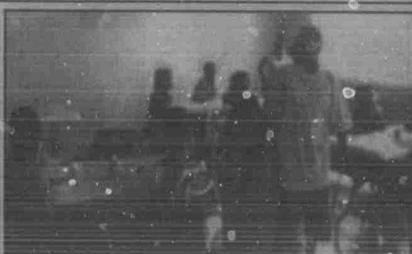
"The games are great at Phea's Boys and Girls Club"

The students may come daily to the boys and girls club and use the computers to access information that will inform them about higher education. Club personnel also assist students in signing up for the college entrance exams such as the