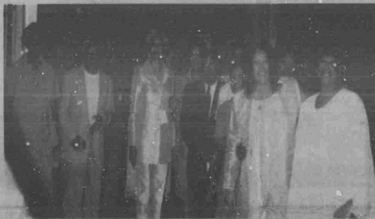
Here are some of the Class of 1959 who were able to be in attendance at the Dunbar High School All Class Reunion in 2004. This photo is being published because all are excited about the 50 years of the Dunbar High School facility which is now a middle school.