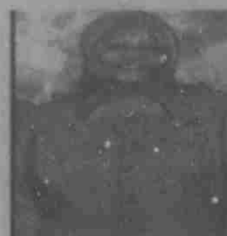
more information call

support, thins your hips, lifts and hold your buttocks up in position. Ladies believe me, when I tell you it's magic. This innovative creation will sensationally reshape your figure by reshaping you from your shoulders to your legs. It will give you the appearance of a liposuction without surgery. Immediately taking you down 2 or 3 dress sizes! Feels like a second skin a variety of styles.