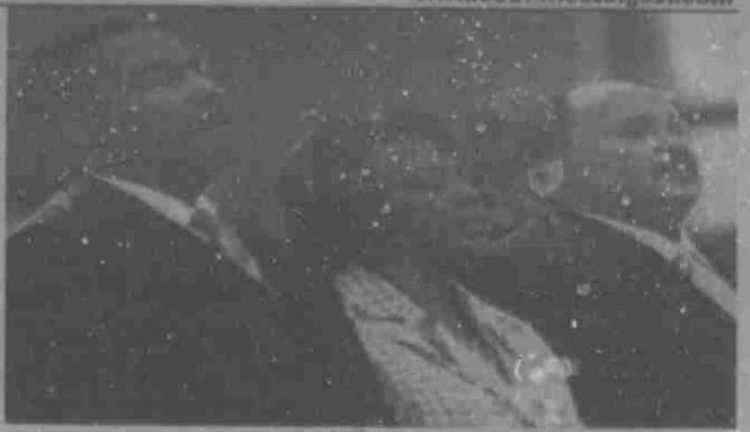
Bernice King & brothers Martin Luther King III Dexter King

Relations among the remaining King siblings have become increasingly strained and the public feud came to a head this summer with the filing of three lawsuits.