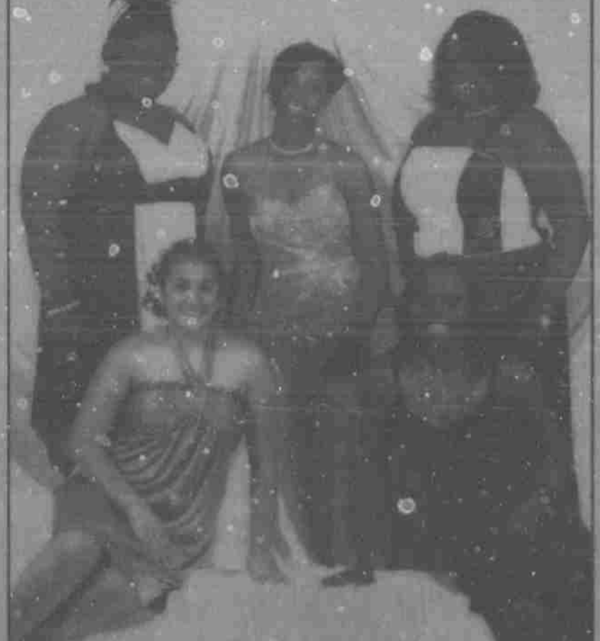
Here they are, the lovely young ladies who were members of the Estacado High School Homecoming Court who were presented during the half-time at Lowrey Field on Friday evening, September 19, 2008.