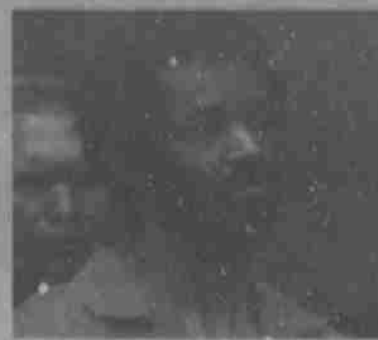
John Allen Muhammad JARRATT, Va.

Sniper John Allen Muhammad refused to utter any last words as he was executed, taking to the grave answers about why and how he plotted the killings of 10 people that terrorized the Washington, D.C., area for three weeks in October 2002.