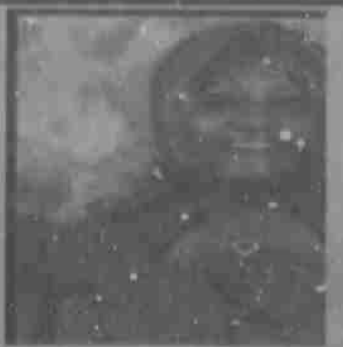
a smile! ***** Fashion...just for the fun of it!

and even mini, you decide what look best on you. Floral prints, bright colors and ruffle details add more pep to your step. How cute is a beautiful colorful sun dress with a pair of matching flip flops. Comfortable and cute, you can't beat that. Fashion tip...always wear