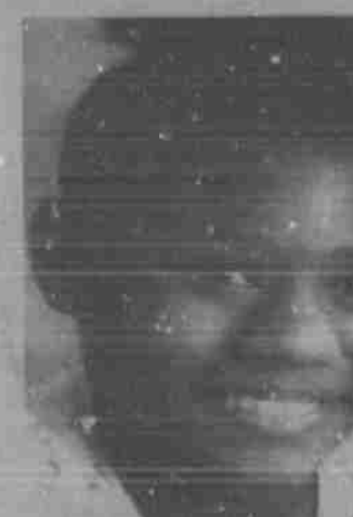
girl, a glamour girl who enjoyed life.