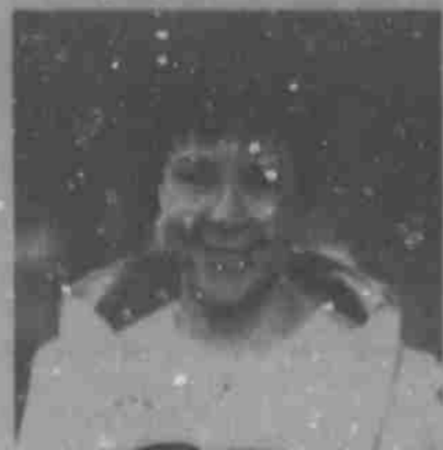
Sheila Crump Johnson

Ms. Johnson has long been a powerful influence in the entertainment industry as a founding partner of Black Entertainment Television (BET) and, most recently, as a film producer. In partnership with other investors, her first film, Kicking It , premiered at the 2008 Sundance Film Festival. She executive produced her second film, A Powerful Noise , which premiered at the 2008 TriBeCa Film Festival in New York, as well as her third film, She Is The Matador .