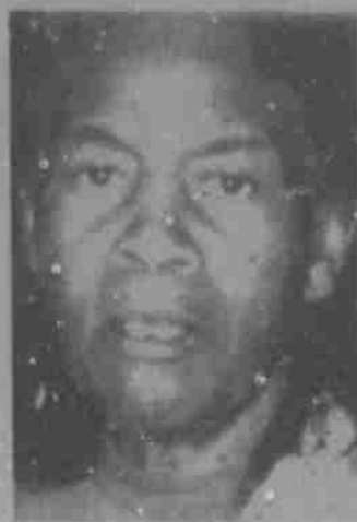
member of Freewill Baptist Church, where she was active in the choir and served as an usher.