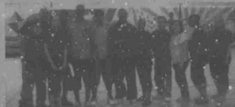
Pictured above are staff members of the Guadalupe-Parkway Somerville Centers who contribute their many talents to the operation of these centers.

Orientation times and dates for this summer's programs are - June 4th, 5:00 p. m. until 6:00 p. m. June 5th, 10:00 a. m. to 11:00 a. m. For more information, call 763-3963.