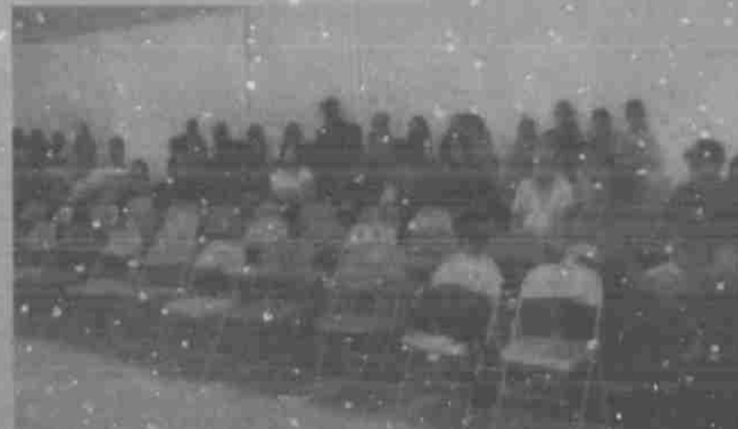
Here is a portion of those who were in attendance of this annual recital. It was a refreshing afternoon.