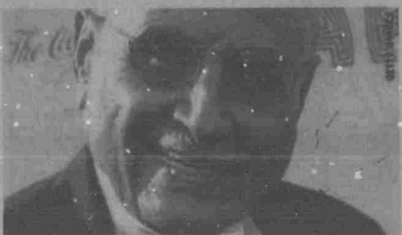
Businessman Percy Sutton served as an intelligence officer for the famed Tuskegee Airmen in World War II.