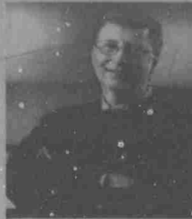
Bill Gates, founder of Microsoft Corporation

In addition to increasing access to higher education for these underrepresented groups, GMS also provides leadership training. Through participation in a comprehensive leadership