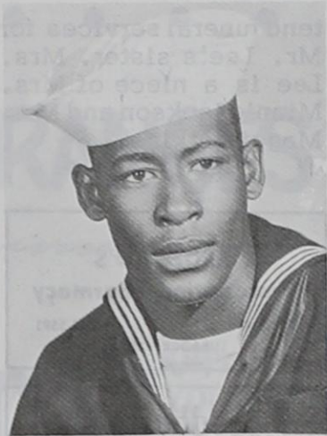
The groom is also a graduate of Dunbar and a veteran of the United States Navy. During his four years of service he worked as an aircraft mechanic, and also completed a voyage around the world.