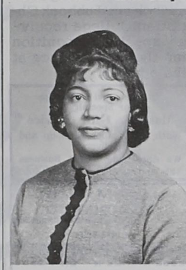
city limits, there is a new member of the ex-

In the city of Plainview, Texas---only 52 miles from the Hub City's